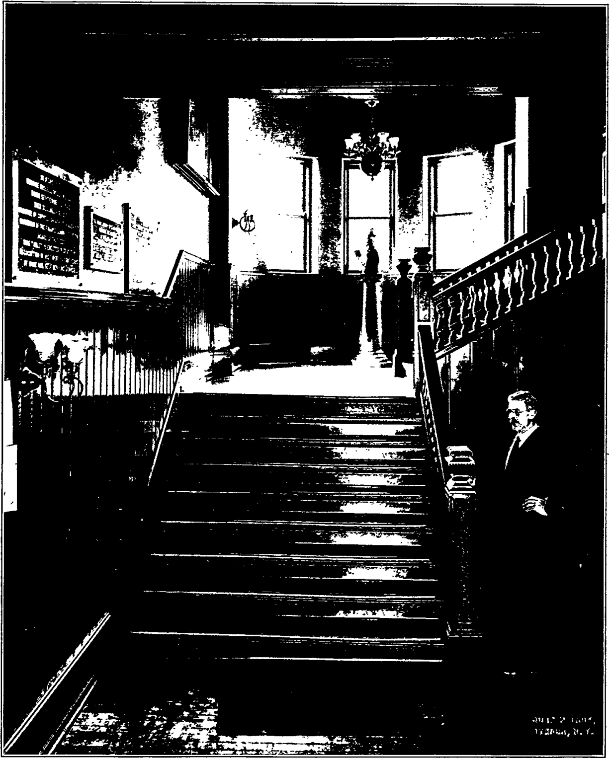
BOARDMAN HALL LOBBY